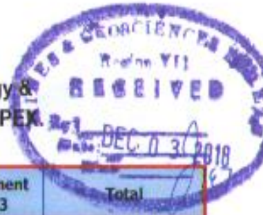
Table 2. 5 Year Social Development and Management Program (SDMP), Development of Mining Technology & Geosciences (DMTG) and Institutionalization of Public Awareness (IEC). 1.5% of total projected OPEX.